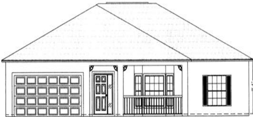
FRONT ELEVATION 'C'